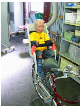
The photo showing a setup before the test

(2) An example of the condition when a dummy was placed on a high-back child seat with the seat belt not fastened and with a helmet not worn by the dummy.