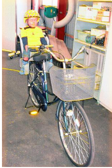
The photo showing a setup before the test

(1) An example of the condition when a dummy was placed on a child seat with the seat belt fastened and with a helmet worn.