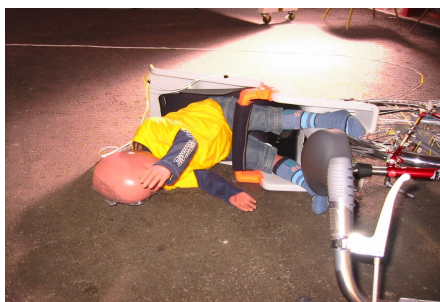
The photo showing a state after the fall