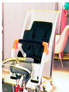
Figure B: High-back child seat