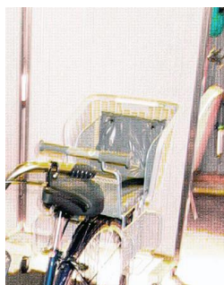
Figure A: Low-back child seat