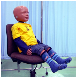
Anthropometric test dummy of a three-year-old child