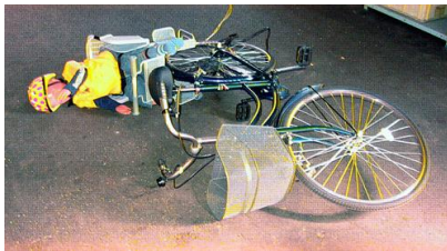
The photo showing a state after the fall

(2) An example of the condition when a dummy was placed on a high-back child seat with the seat belt not fastened and with a helmet not worn by the dummy.